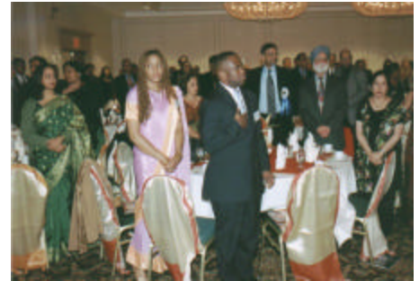
Members and Guests