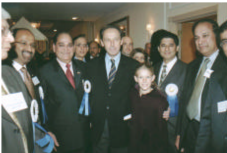
Chief Guest and Officers