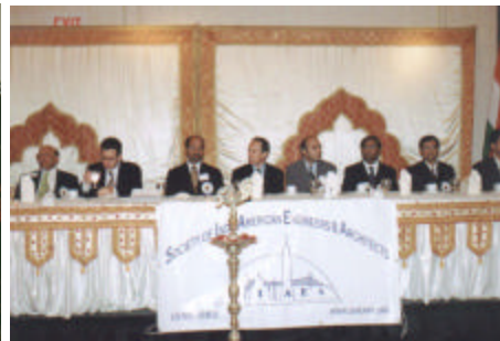
Chief Guest and Members