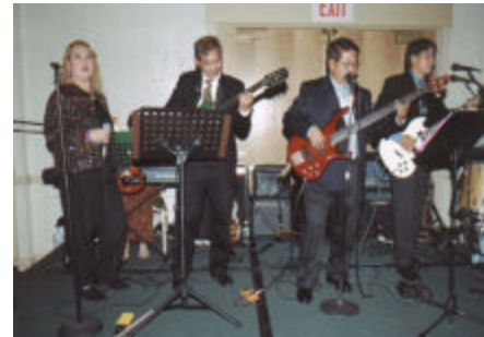
Live Music Band