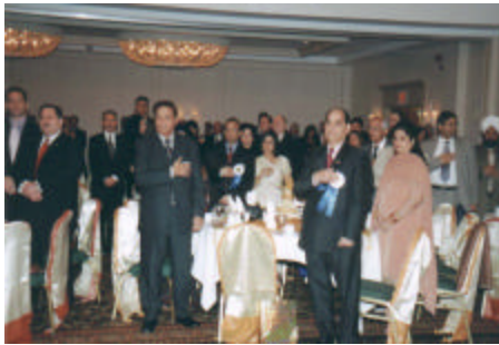
Members and Guests