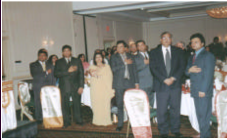
Members and Guests